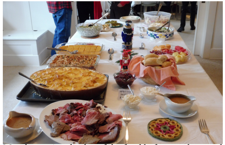
Mouthwatering display of the food before we devoured it.

There were so many great pictures and it's obvious we were having a great time but I can't include them all, so will share a few.