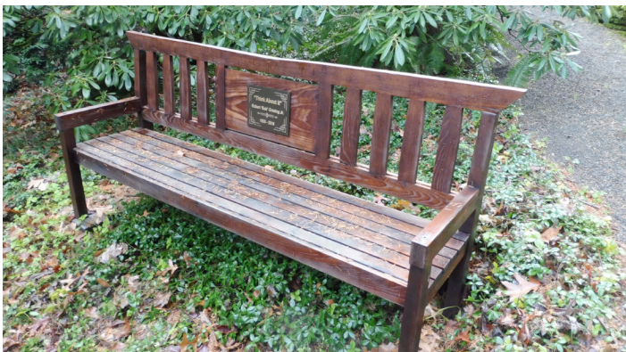
The completed bench with plaque applied.