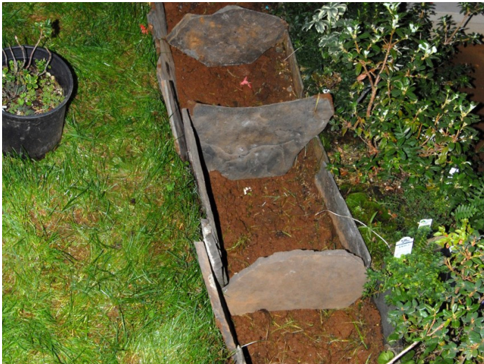
Lining the areas with vertical slates to make a slightly raised bed