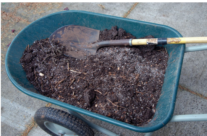
Creating alpine soil conditions with 2/3 inorganics (washed quarter ten rock and pumice) 1/3 commercial potting soil with some native dirt, which repopulates the mix with normal soil organisms.

These are not exactly native alpine conditions. In the high mountains of the Himalayas and Southwestern China these plants are exposed to direct sunlight some of the time....In the spring usually until the rising afternoon mists shield and water them. In their summer they get clouds and monsoon rains whereas here it is the hot, dry season. We somewhat recreate the monsoon by dry season irrigation. In their winter native habitat some of these plants may be covered by snow or be out in the open....most are very cold hardy.