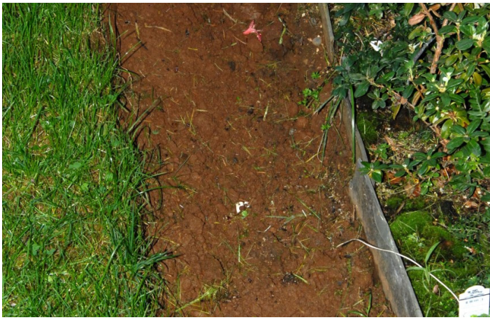
Removing the sod