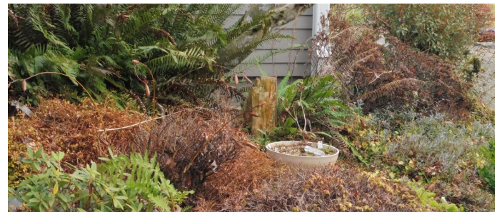
Bad times after the summer “toasting season”

So I decided that it was time for a change of habitat. Behind my garage there is an area that gets good morning sun but is shaded from noon on until the last daylight rays hit it. There I recreated alpine conditions sans the heat and intense solar radiation.