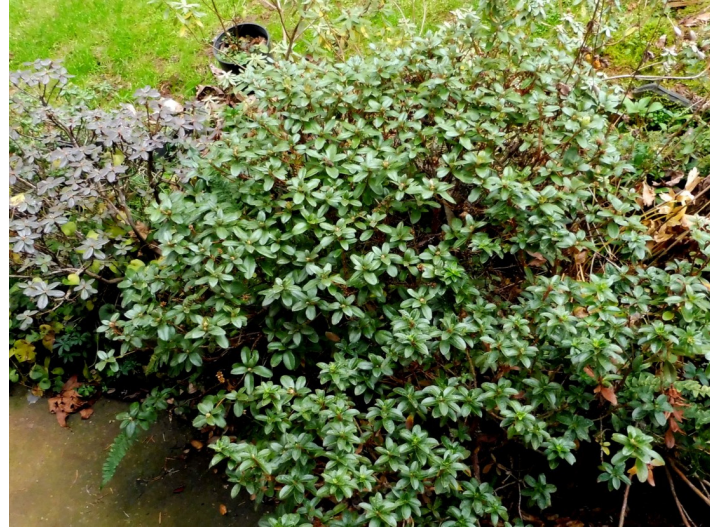
Too much success. Need to separate, thin and replant this winter.