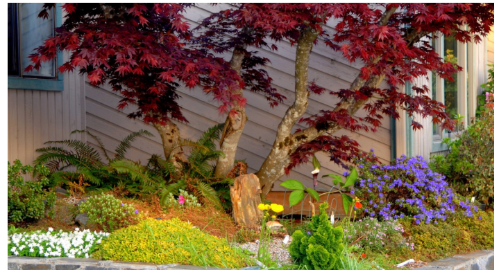
Front rock garden. Good times.

How to grow (surviving) alpines in our “Mediterranean” climate had eluded me until a few years ago. In front of our house, under a Japanese maple we have the perfect little raised rock garden bed. In the shade of that maple I have grown R. sargentianum , calostrotum , impeditum , hanceanum nanum , keiskii ‘Yaku Fairy’ foresstii ‘repens’, many campylogynim and a host of other high altitude little rhododendrons. Emphasis on the past tense. These plants may do well for a few years until they are killed by the intense summer heat generated by the southwest facing bed situated next to a cement driveway. This is despite careful automatic watering and misting. Requescat in pacem : may they rest in pieces on the chipper pile