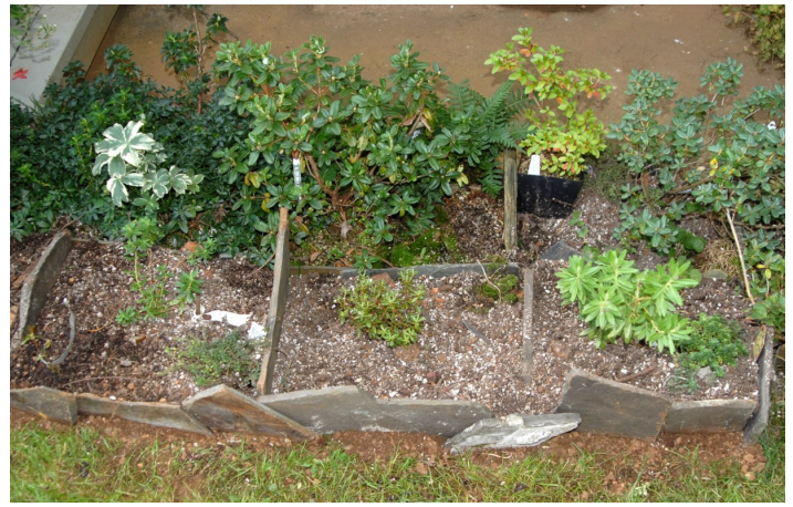
After planting, perfect drainage with this soil mix