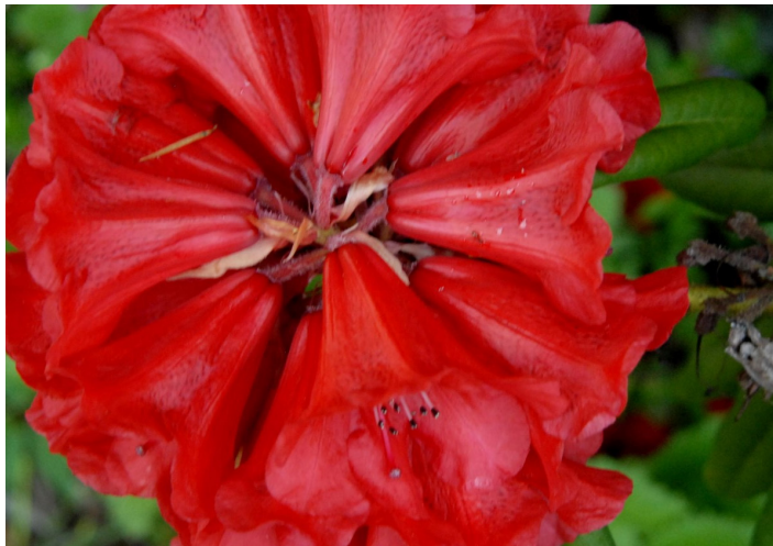
Name the 3 Species Rhododendrons on this page - Answers on the last page of the newsletter