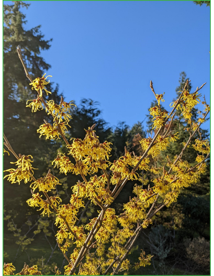
Brilliant blue sky contrasting with the vibrant yellow of Hamamelis 'Arnold Palmer'