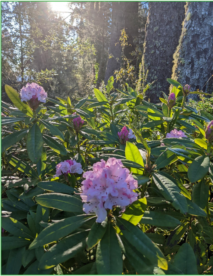
R. 'Cheer' basking in the understory of tall spruce