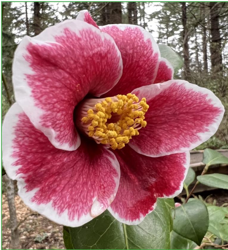
Above - Camellia japonica 'Kakureiso'