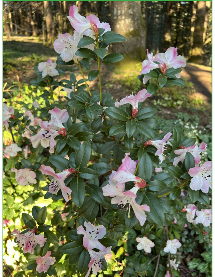
Rhododendron moupinense RSBG 69/109