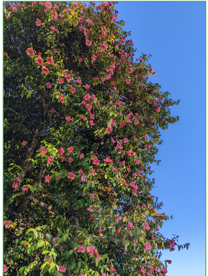
This camelia is a hummingbirds paradise