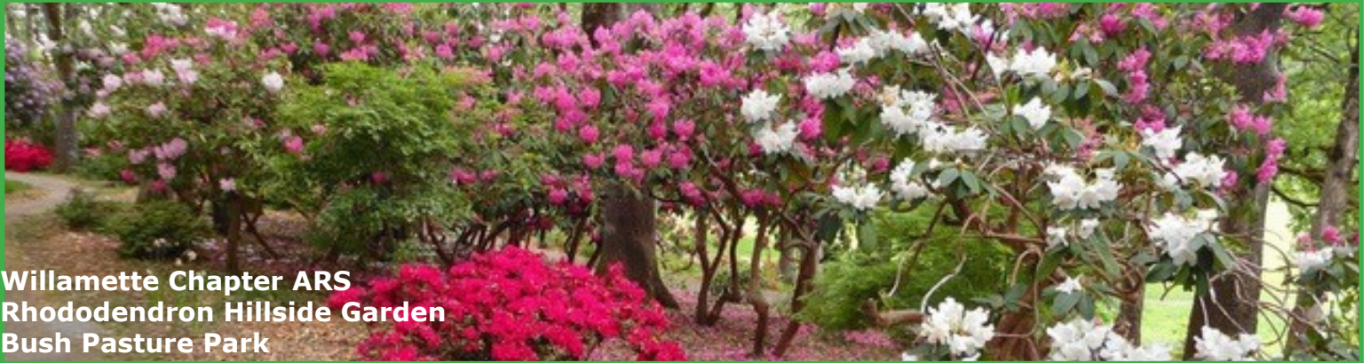
Willamette Chapter ARS Rhododendron Hillside Garden Bush Pasture Park

CHAPTER MEETINGS: Our current chapter meetings are held on the 2nd Wednesday of the month from September through May. Our meeting may be in person or via Zoom. Meeting information will be sent to members via email and available in this newsletter. In person meetings will be at the RAM Restaurant and Brewery Bearcat Room, 515 12th St SE, Salem, 97301, with dinner at 5:00pm and the meeting at 7:00pm.