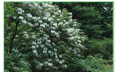
Plant Habit, Flowering, July