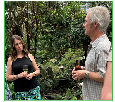
The lushness of the plants inside the Conservatory