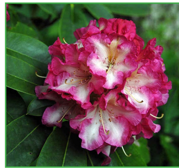
Consolini's Windmill