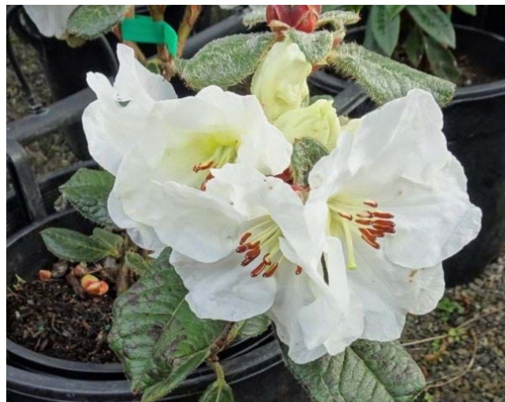
Rhododendron September Snow

This is a lovely variety producing fragrant flowers in early spring.