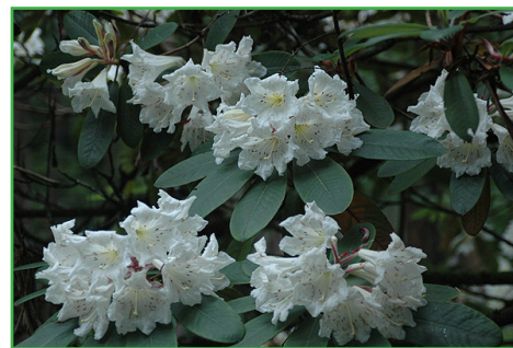
Flower Trusses and Leaves