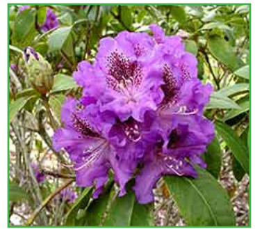
Blue Boy