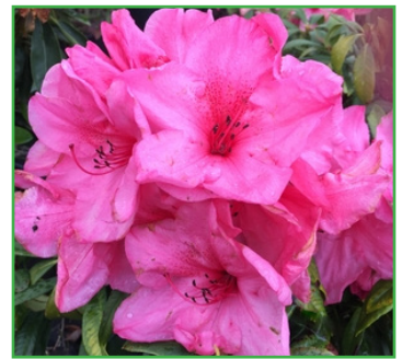
John Coutts