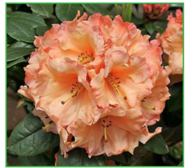
Wild Ginger