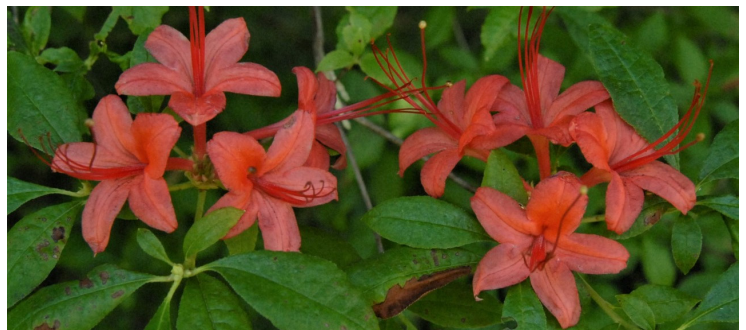
R. prunifolium (southeastern US azalea) currently blooming in Keith White's yard.