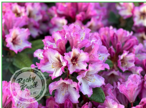
Rhododendron Prism's Sister

We will learn what that means and much more, so please plan to attend!