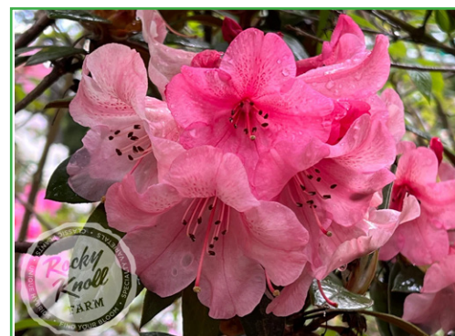
Rhododendron Slim B